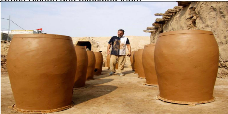
Indians making clay pots in the city of Nazari, in November.

40 And Elijah said to them, “Seize the prophets of Baal! Do not let one of them escape!” So they seized them; and Elijah brought them down to the Brook Kishon and executed them